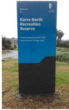
Sign identifying the reserve and tenant clubs

These signs are provided and maintained by Council.