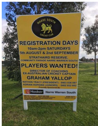
Example of temporary event signs